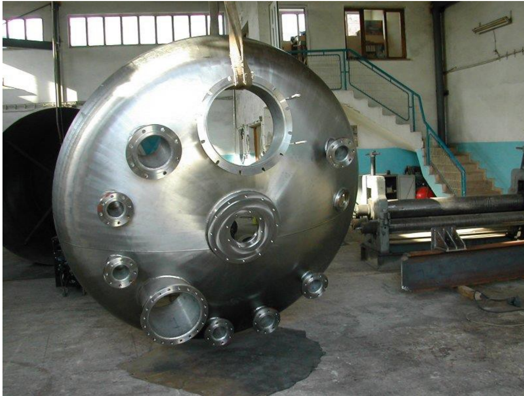
N e u t r a l i s a t o r