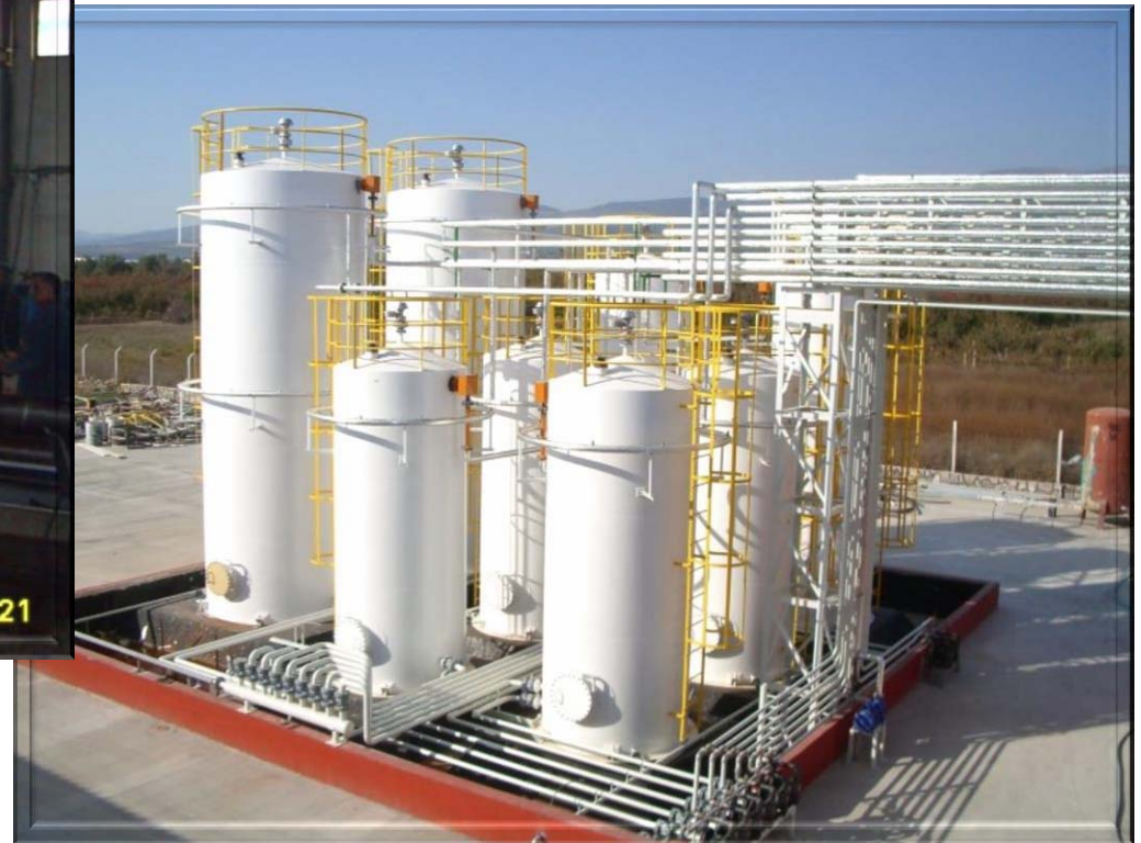
Solvent Storage Tanks