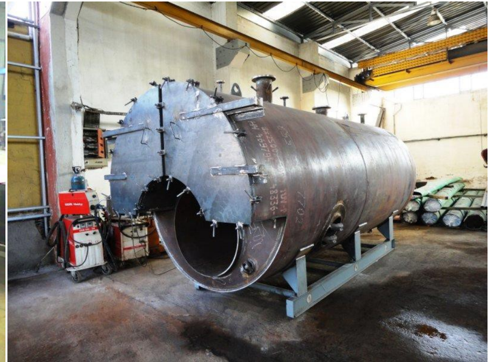
B o i l e r