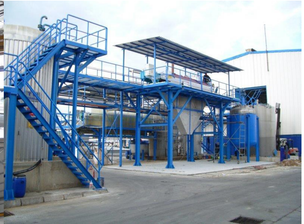
Filter Press Plant & Dust Filter