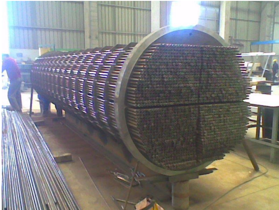
H e a t E x c h a n g e r