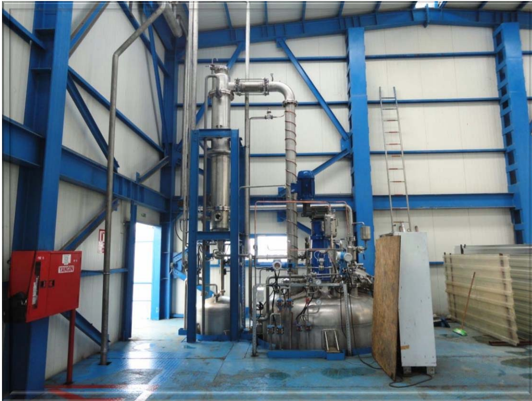
Reactor assembling and piping