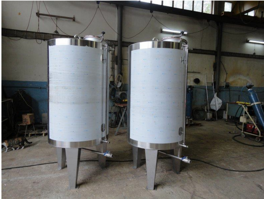
Olive Oil Tanks