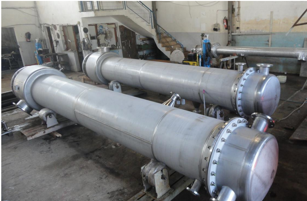
Olive oil Heat Exchanger