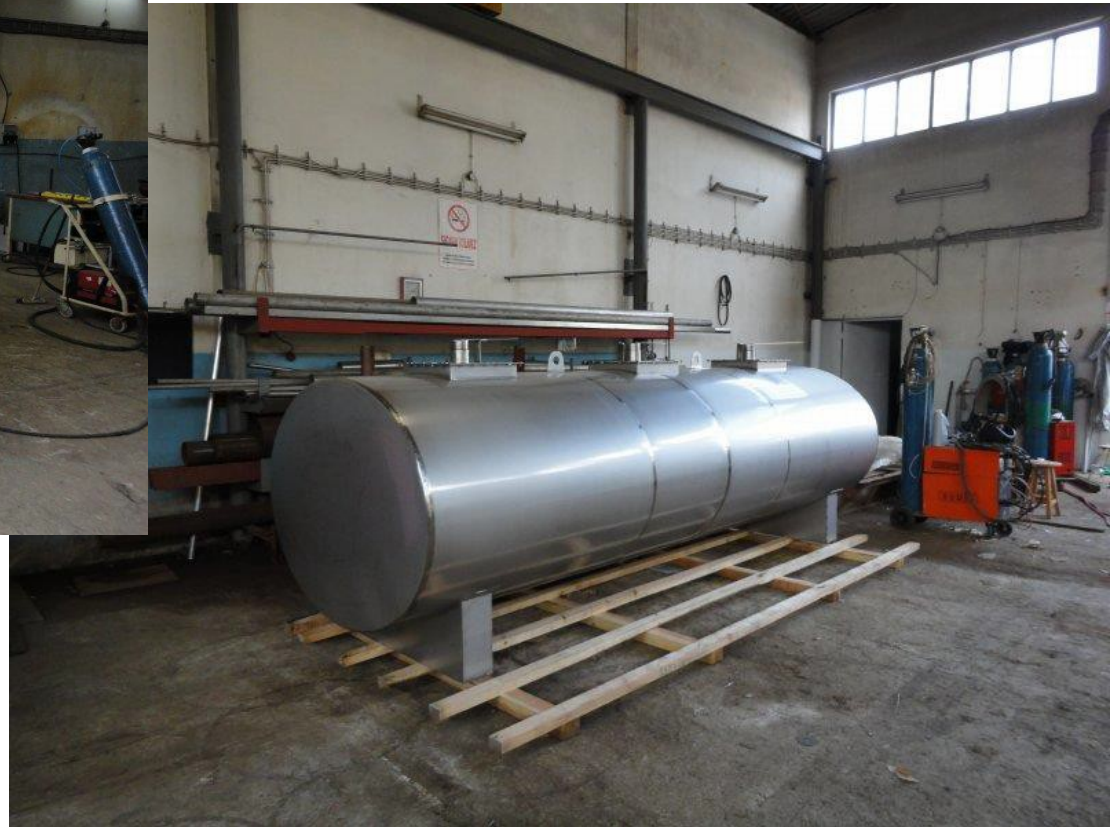
Olive Oil Tank