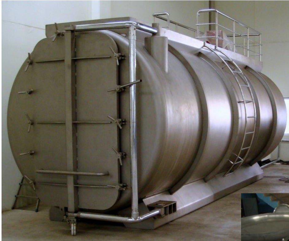
Wood Drying Furnace